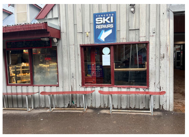
Figure 2 Facing Avalanche cafe Not

Staff accommodation windows, north elevation. Note deterioration of the roofing, poor condition of and installation of inappropriate sliding windows and some deterioration of timber cladding.